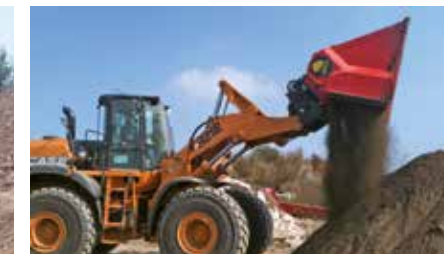
Screening top soil