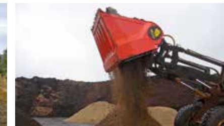
Mixing top soil and sand