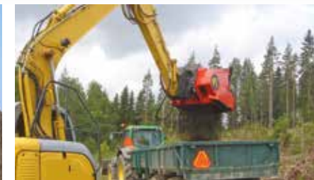
Screening and loading peat