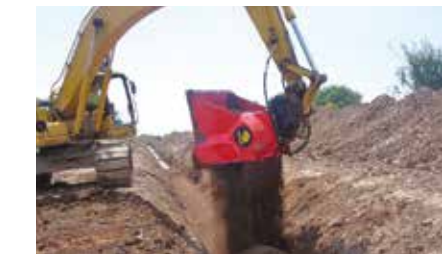
Pipeline padding/back filling