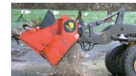
Aerating biowaste compost