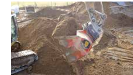
Stabilising foundation layers