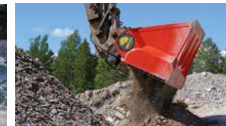
Crushing bricks / black top asphalt