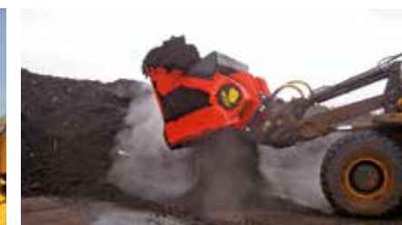
Aerating sludge compost