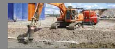
ALLU Stabilisation System Mixing soil and binding agent in mass stabilisation