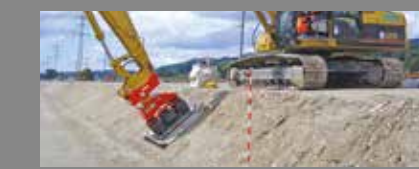
ALLU Compacting Plate High power compacting plates for demanding job sites