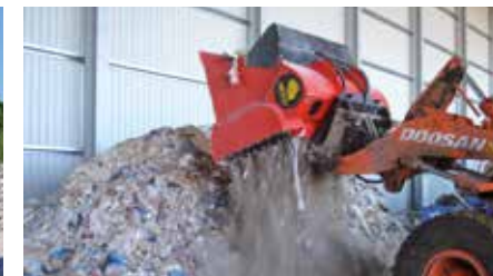
Crushing demolition waste