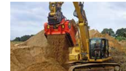
Mixing sand and clay