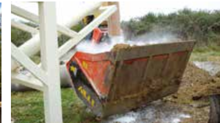
Stabilising soil with lime