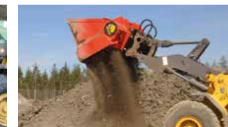
Aerating contaminated soil compost