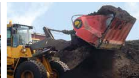
Mixing sludge and bark